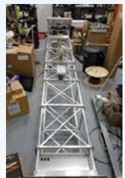
Weather Station Tower Assembly