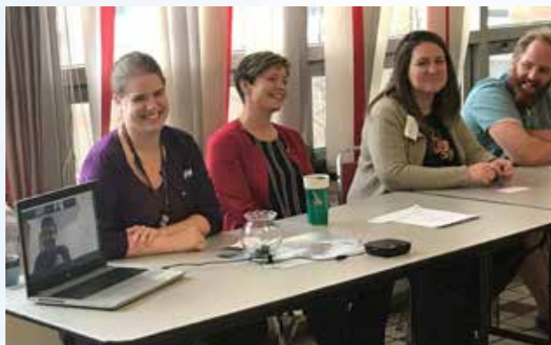
Digby health care providers share a laugh while helping high school students learn about health care careers.

The day was a true community effort, organized by the Digby & Area Health Services Centre, Schools Plus, Turning the Tide/ Inspiring Communities Digby, the Digby & Area Health Services Charitable Foundation, and Atlantic Superstore.