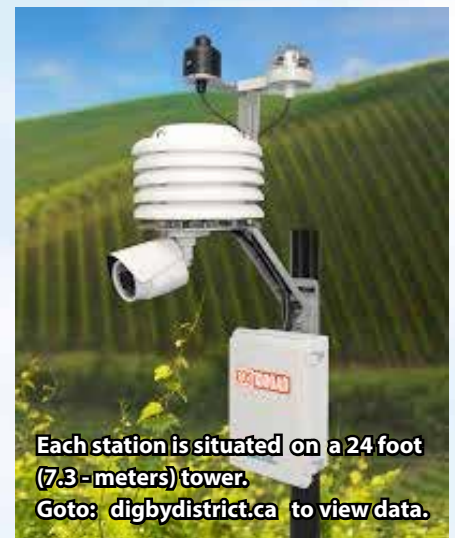
Each station is situated on a 24 foot (7.3-meters) tower. Goto: digbydistrict.ca to view data.

Each station cost $10,000 and the Municipality has received 50% funding from the Provincial Flood Risk Infrastructure Program.